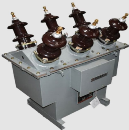
CTPT Pole Unit (Oil Filled)