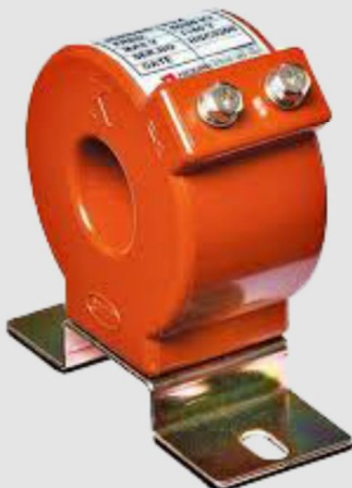
Current Transformers (All ratings up to 200/10 Amp)