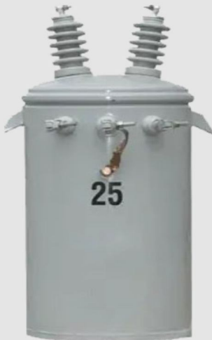
Distribution Transformers- Single Phase (Up to and including 1000 kVA)