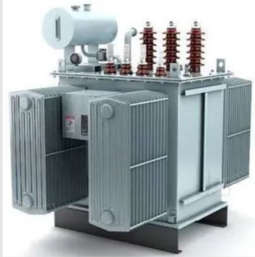
Distribution Transformers- 3 Phase (Up to and including 1000 kVA)